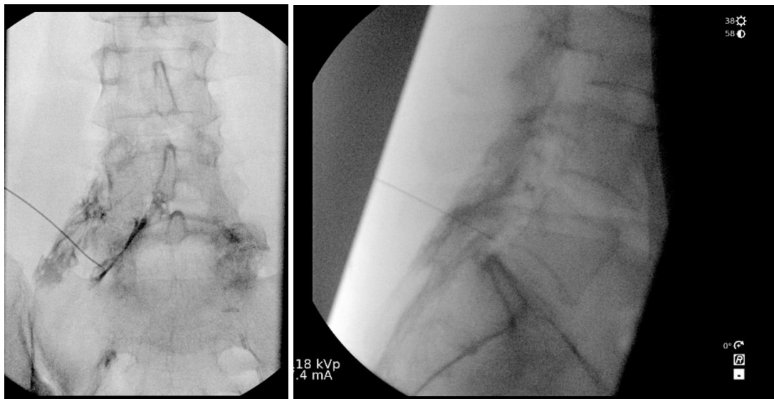
Figure 1: AP and Lateral Fluoroscopic Images of L5-S1 Intervertebral Foramen

completed without an immediate complication utilizing a 5inch 22gauge Quincke needle, omnipaque 300 and with digital subtraction angiography. Once needle position was confirmed 2ml of (2ml of preservative free dexamethasone 10mg/ml and 4ml of bupivacaine 0.25%) was injected at each level indicated left L4-L5, L5-S1, S1-S2 levels. Twenty four hours after the procedure patient presented to the emergency room with left lower extremity paralysis. MRI and a CT scan of the lumbar spine were completed to rule out epidural hematoma and spinal cord infarction. Brain MRI and CT were performed and completed with no evidence of infarction or stroke. In addition, a neurologist and neurosurgery were obtained. It was determined that the patient may have an allergy to bupivacaine or dexamethasone. Currently the patient is still suffering from chronic neuropathic lower back pain and left lower extremity paralysis. She was recently successfully trialed for a spinal cord stimulator at T9 with over 70% pain relief. She is scheduled for Nevro HF10 implant.